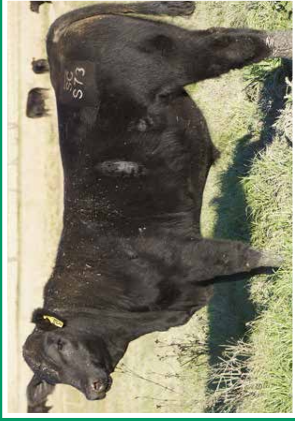
Lot 77 Brooksby Prometheus S73