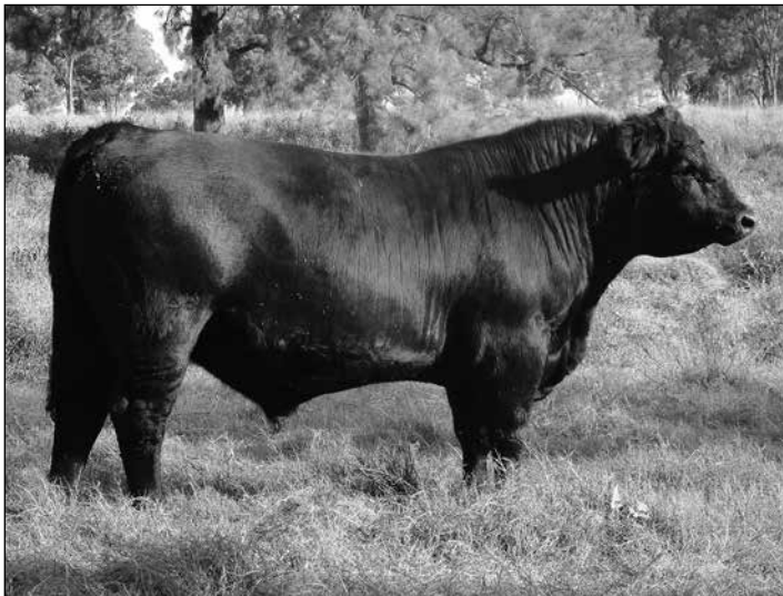
MERRIDALE PARIS P24 PV