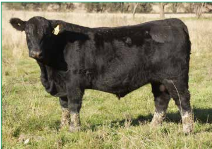
Lot 57 Brooksby Black Pearl S66