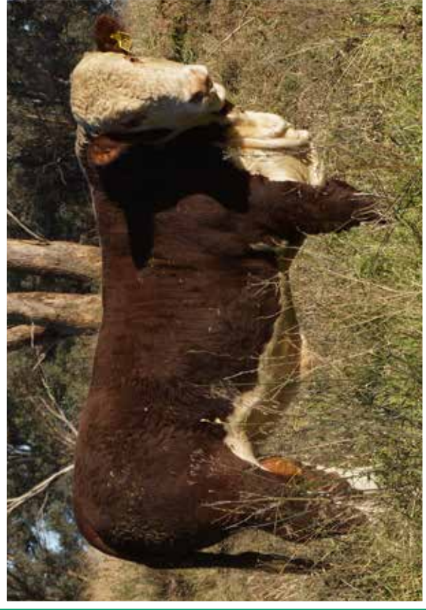
Lot 8 Glenwarrah Marshall R277 (H)