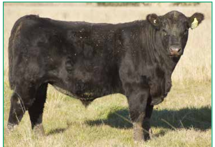
Lot 59 Brooksby Paris S139