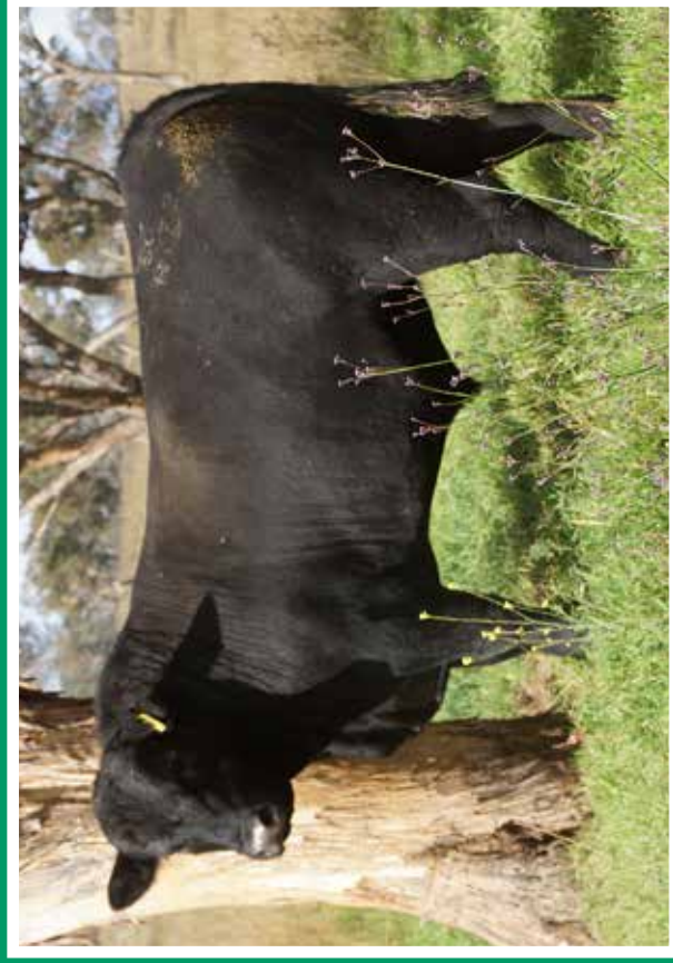
Lot 27 Brooksby Navigator R172