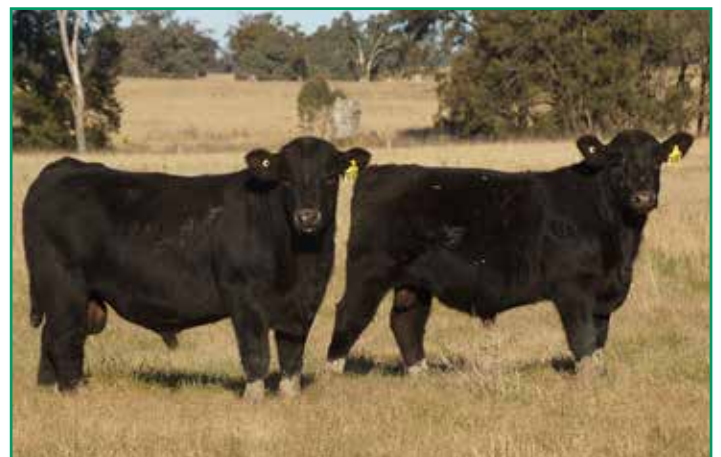
Lot 61 Brooksby Black Pearl S35 Lot 67 Brooksby Prometheus S80