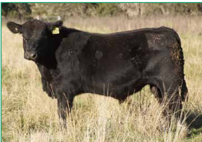
Lot 61 Brooksby Paris S132