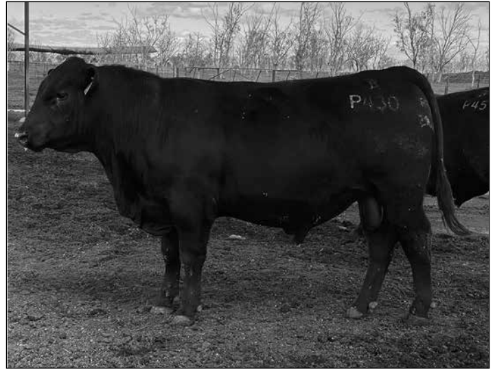
BULLIAC PROMETHEUS P430 SV