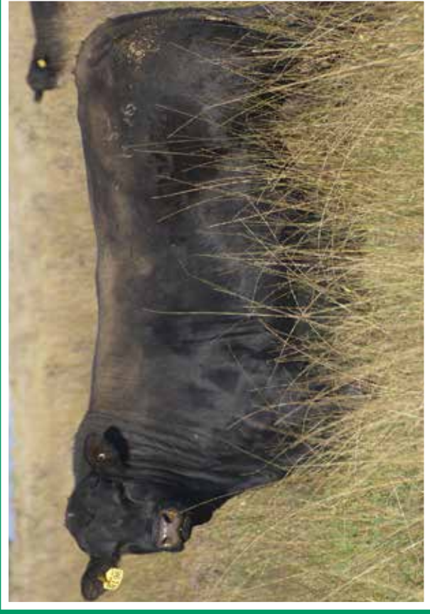
Lot 50 Brooksby Kerr R196