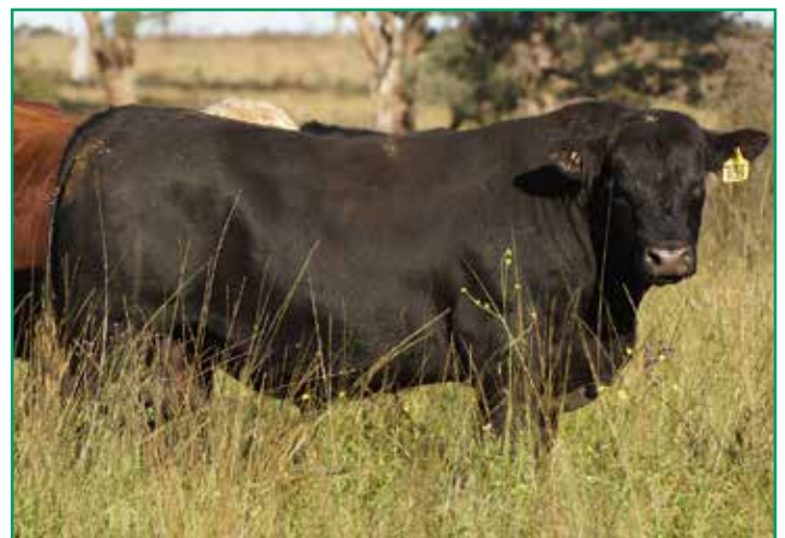
Lot 34 Brooksby Jermaine R039