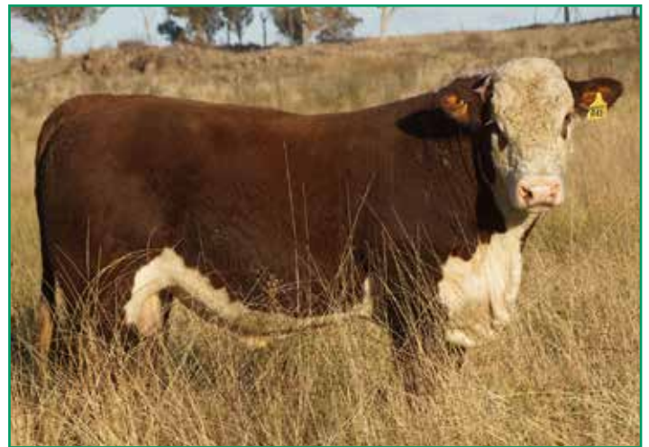
Lot 5 - Glenwarrah Nottingham R41 (P)