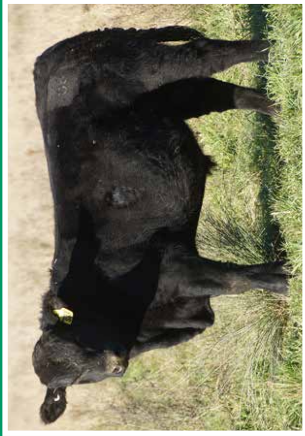
Lot 72 Brooksby Paris S88