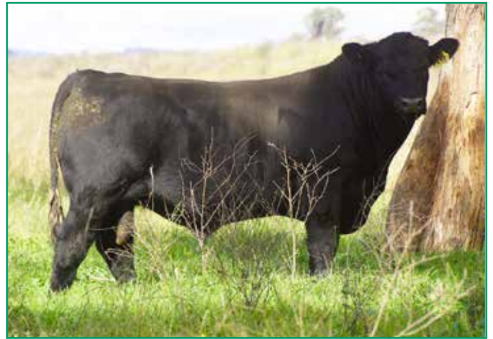
Lot 38 Brooksby Kerr R200