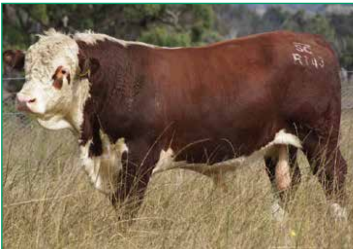
Lot 6 - Glenwarrah Quotation R143 (H)