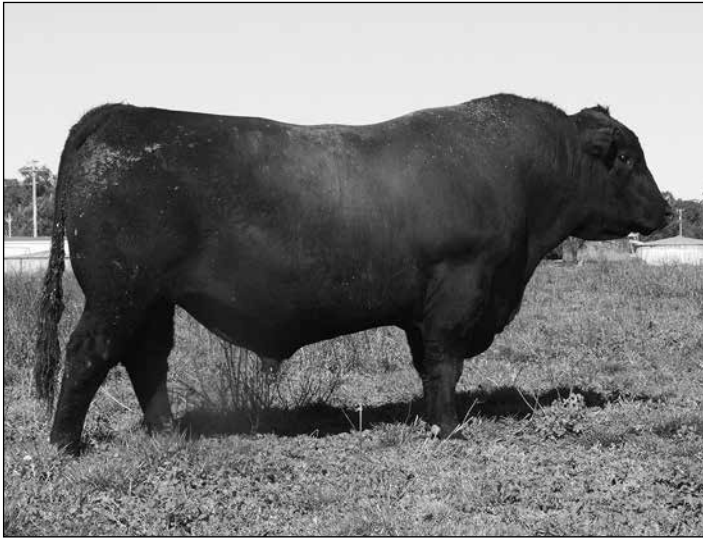
CLUNIE RANGE NAVIGATOR N931 PV