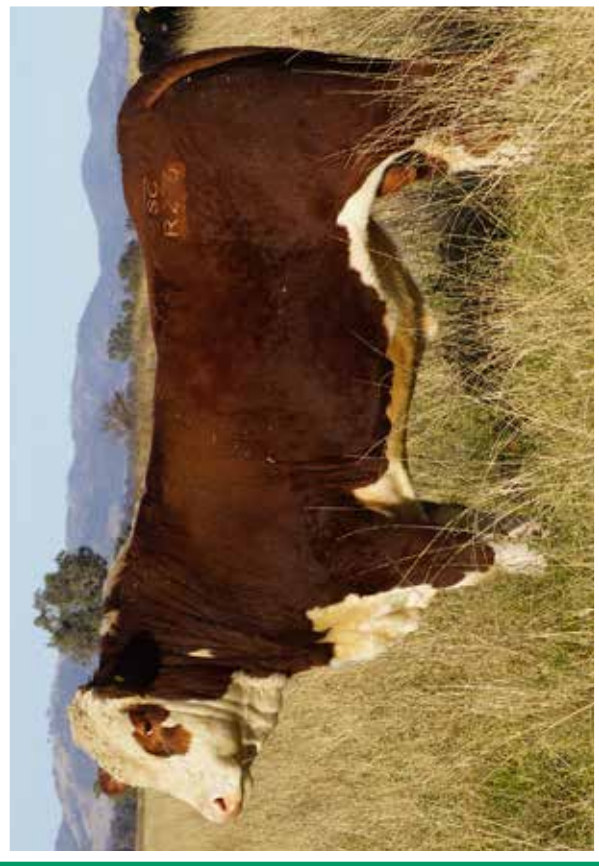
Lot 3 Glenwarrah Marshall R276 (H)