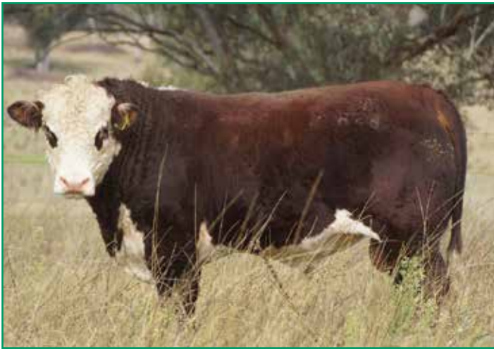
Lot 4 - Glenwarrah Marshall R128 (P)