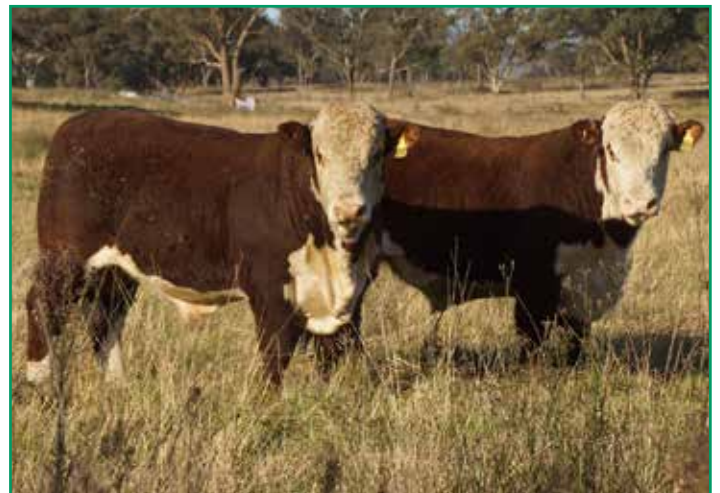
Lot 8 - Glenwarrah Marshall R277 (H) Lot 9 Glenwarrah Marshall R300 (H)