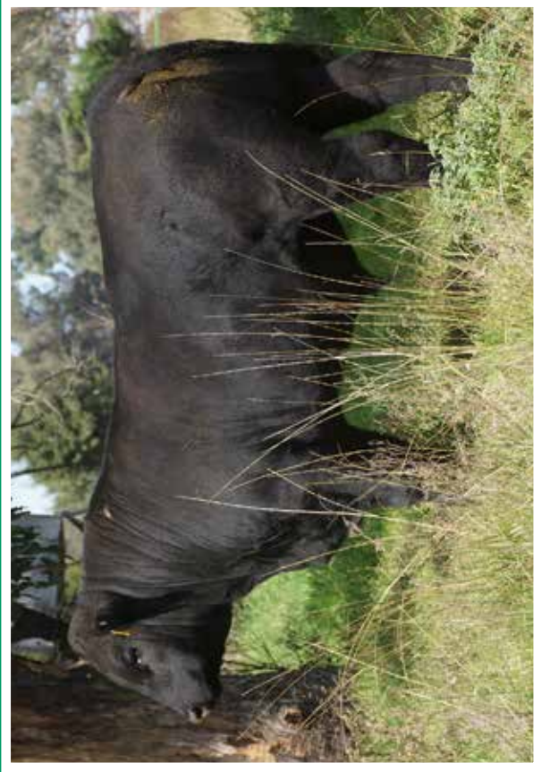
Lot 41 Brooksby Navigator R175