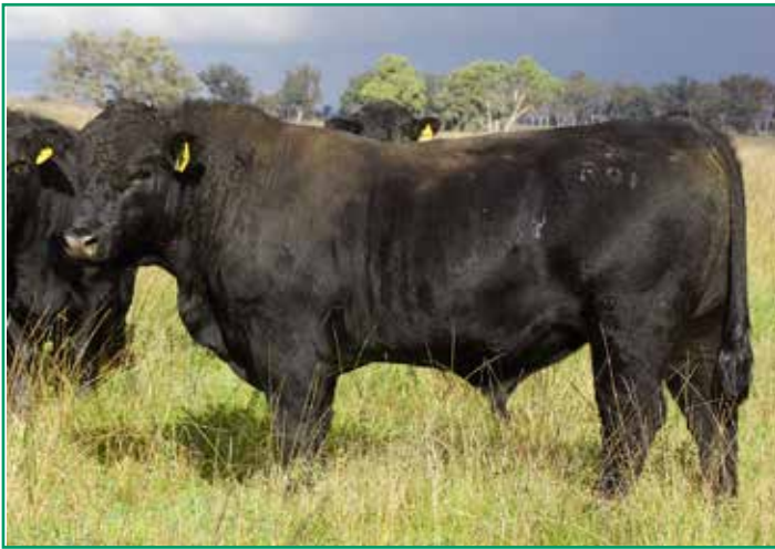
Lot 36 Brooksby Regent R091