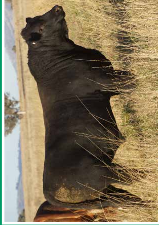
Lot 28 Brooksby Navigator R74