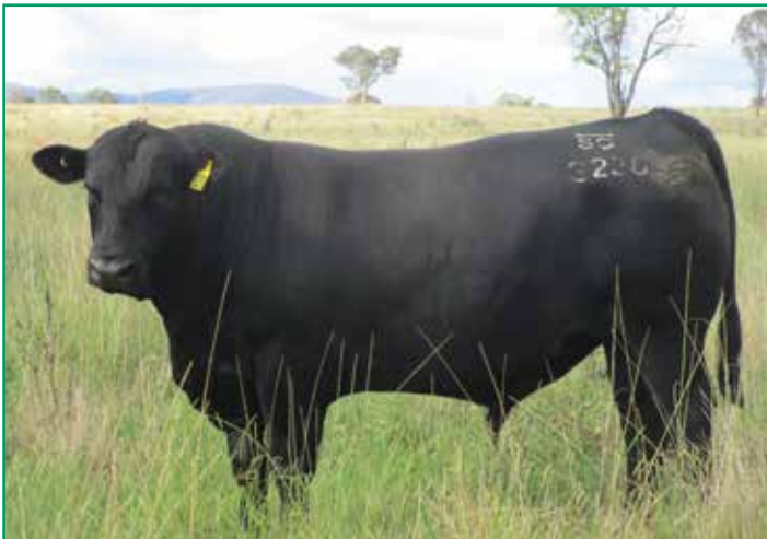
Lot 5 Brooksby Portugal S228