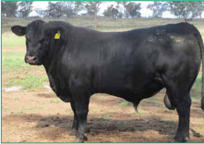
Lot 2 - Brooksby Power S143