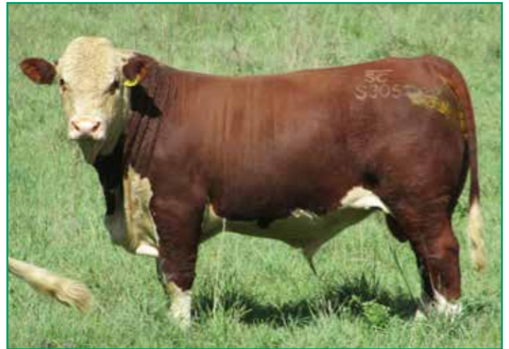
Lot 62 Glenwarrah Marshall S305