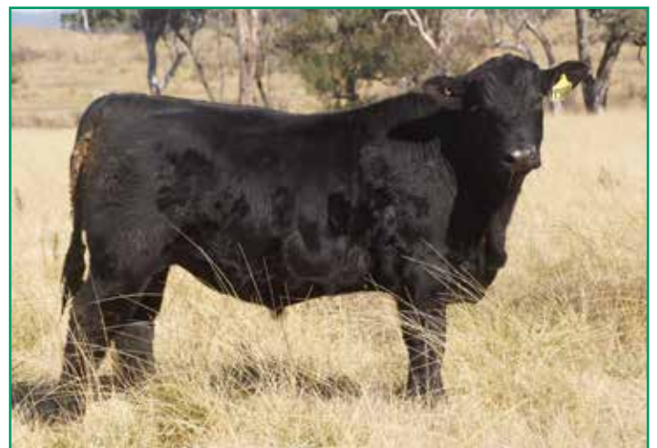
Lot 82 Brooksby Portugal T386