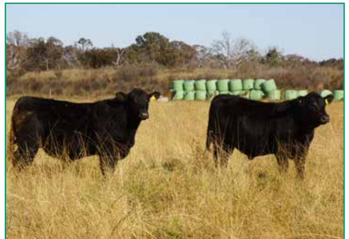
Lot 79 (L) Brooksby Reality T432 Lot 73 (R) Brooksby Paris T427