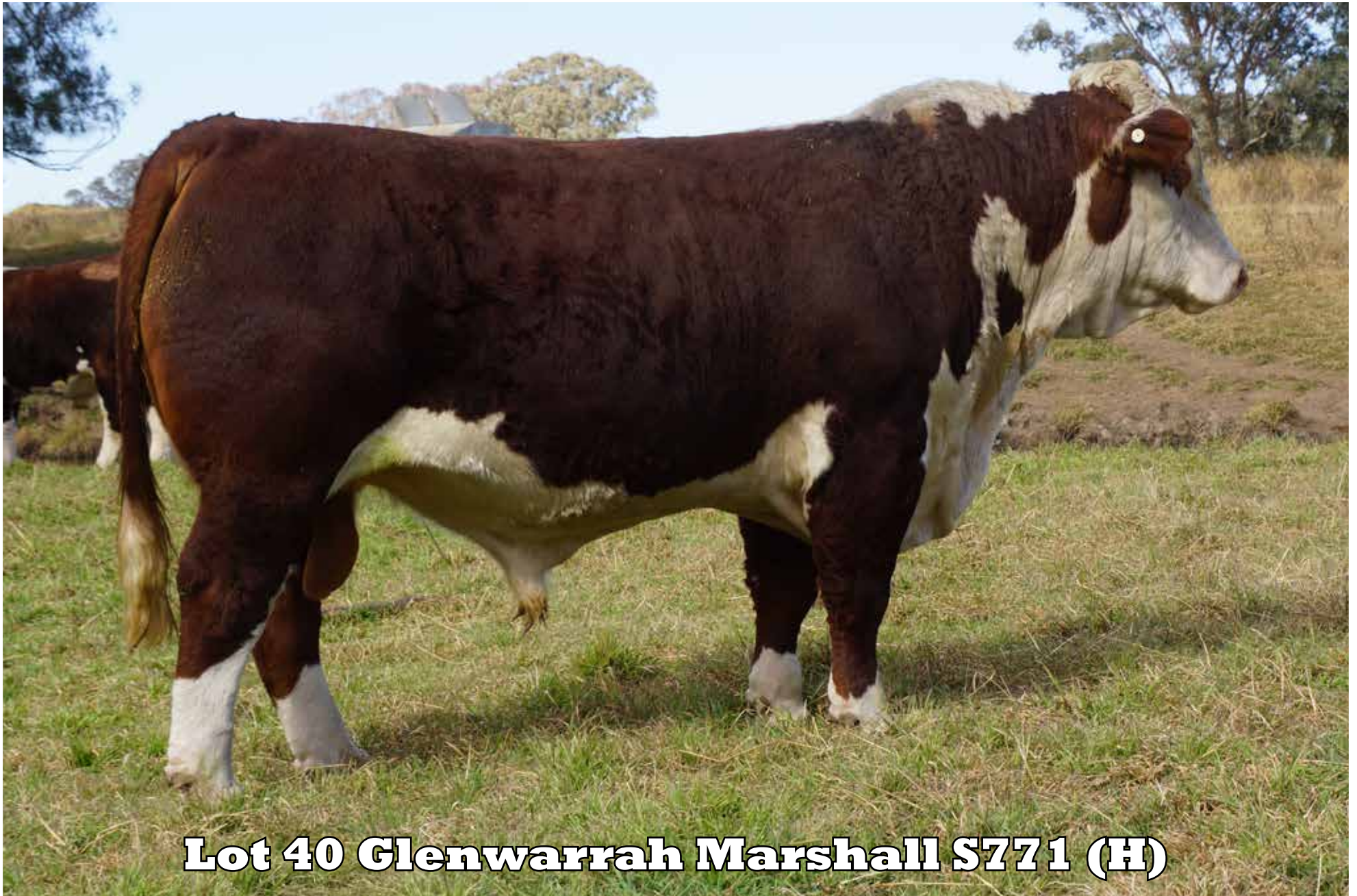
Lot 40 Glenwarrah Marshall S771 (H)