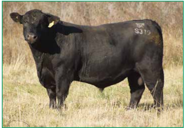
Lot 3 Brooksby Prometheus S319