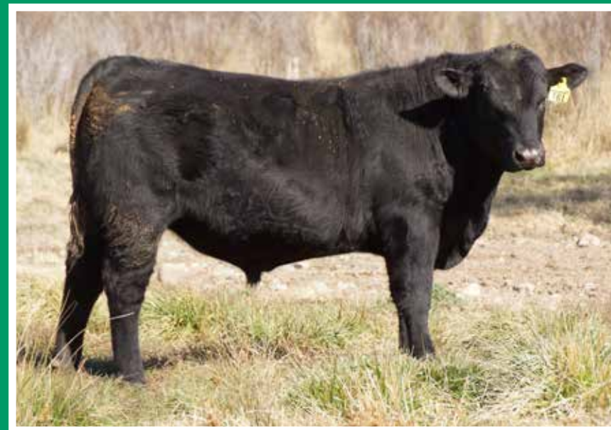
Lot 86 Brooksby General T061