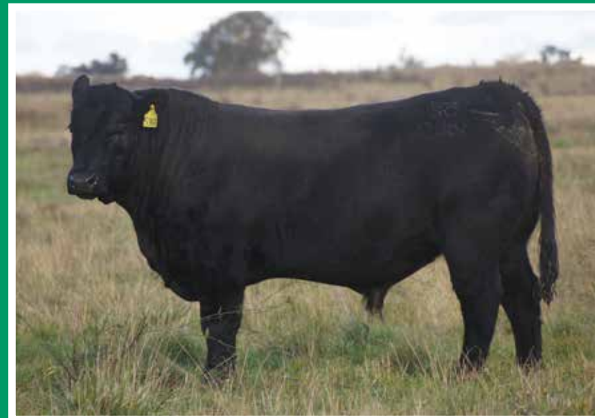
Lot 28 Brooksby Narbethong S366