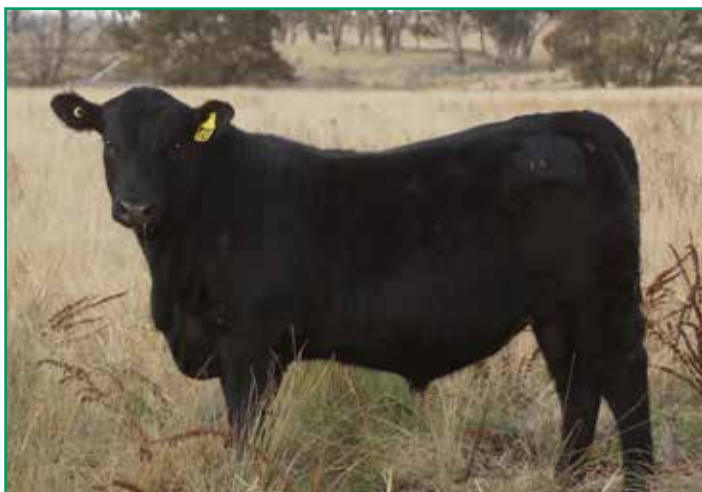
Lot 81 Brooksby Paris T431