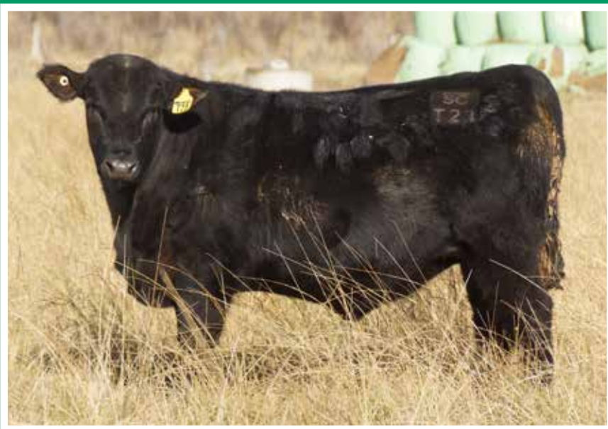
Lot 74 Brooksby Leading Edge T023