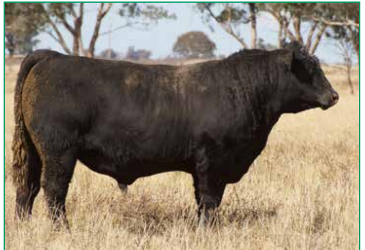
Lot 13 Brooksby Narbethong S335