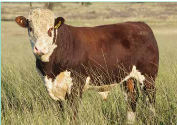
Lot 41 - Glenwarrah Frank S269