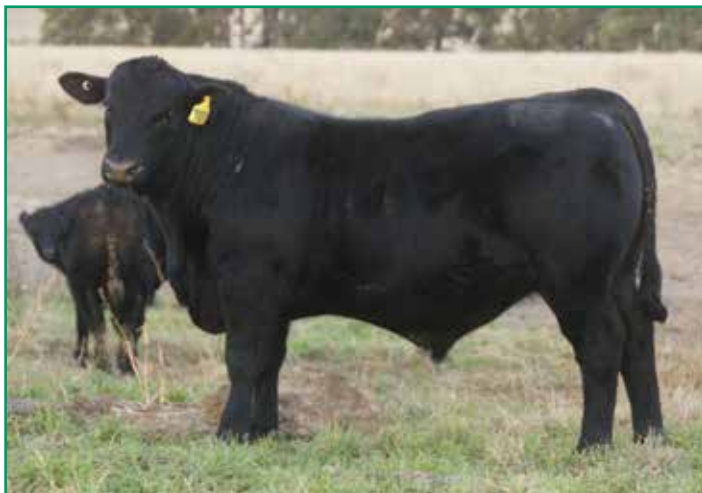
Lot 72 Brooksby Paris T065