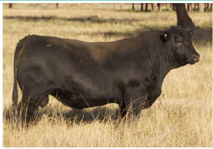
Lot 26 Brooksby Portugal S225