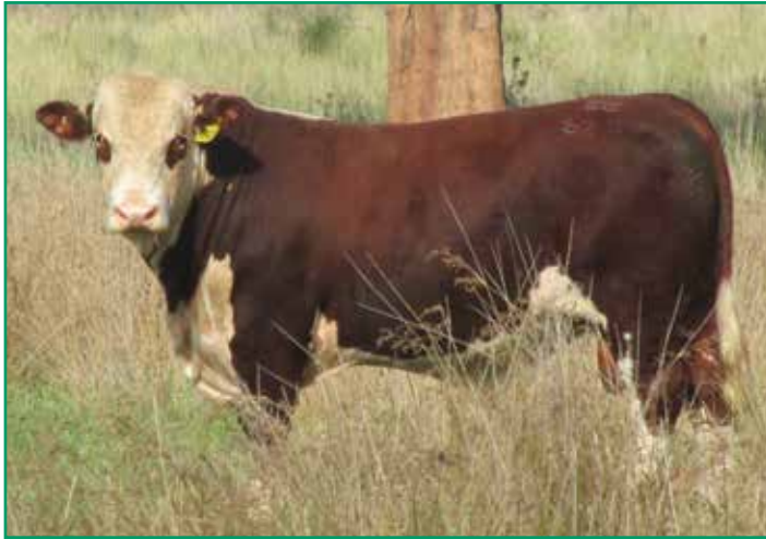
Lot 52 Glenwarrah Marshall S253