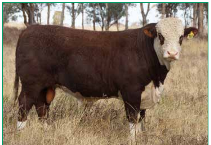
Lot 45 Glenwarrah Marshall S090